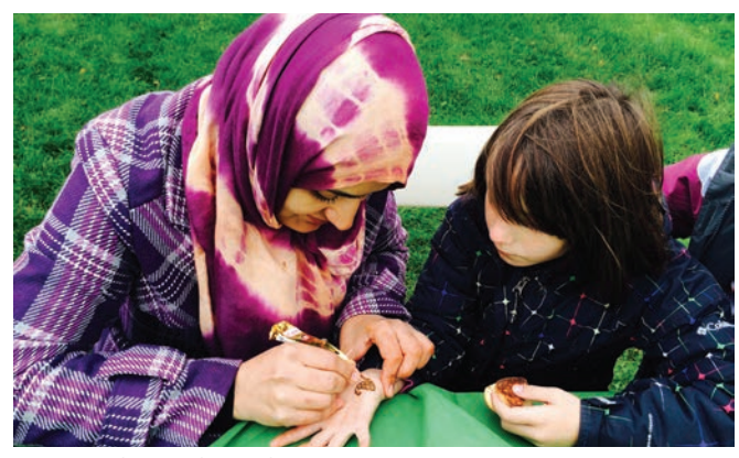
Henna in Flemingdon Park

While improving the physical infrastructure in a park—more benches, better maintained flower gardens, improved pathways—can invite more people to use it, it's activities and events that encourage people to stick around and meet others. Given the right conditions, parks can become, as Mark Glassock from the Los Angeles Neighborhood Land Trust said, a "civic hub" and "community living room."