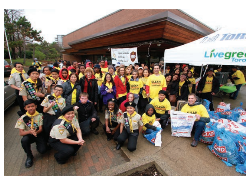
Earl Bales Park clean-up

We administer funding programs to partly address these barriers. The Weston Family Parks Challenge, for example, provided more than $5 million in funding to innovative park projects around the city between 2013 and 2016, including many in lower-income, newcomer communities. Meanwhile, our ongoing TD Park Builders Program focuses on underserved neighbourhoods by providing micro-grants of up to $5,000 to support nascent park friends groups to host activities and make park improvements, like better community gardens. Many of the groups that were supported through this program, such as the Flemingdon Urban Fair Committee included in this report, have since dramatically expanded their activities and continue to grow. The work they do is inspiring.