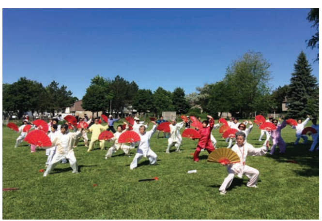
Friends of Chester Le Park Tai Chi Day

The TD Parks Builders Program, administered by Park People, targets its small grants towards low-income communities. Park People works with residents who can apply for grants of up to $5,000 to cover the cost of a first event or a series of small activities, offering continued support throughout the application and implementation process. Often these initial activities are the first programming that people have seen happen in these parks. Some of these park groups have built up their capacity from these micro-grants to later apply for larger, more complex grants. For example, the Flemingdon Urban Fair Committee used TD Park Builders' funding to put on a series of events including a multicultural festival, ravine walk, park cleanup, and a day of physical activity in the park. Other groups, such as the Panorama Community Garden Group in Rexdale, built their capacity to apply for larger grants using an initial investment from the TD Park Builders Program.