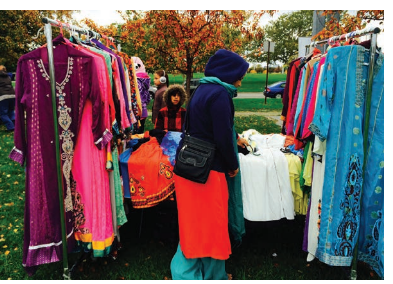
Flemingdon Park Market

Parks are already the sites of weekly farmers' markets where local produce and food items are sold, but some parks, such as Toronto's Flemingdon and R.V. Burgess Parks, are testing new models where locally made products, such as jewellery and clothing, are sold alongside food. These markets provide space for local residents, often newcomer women, to engage in small-scale economic activity and build their clientele.