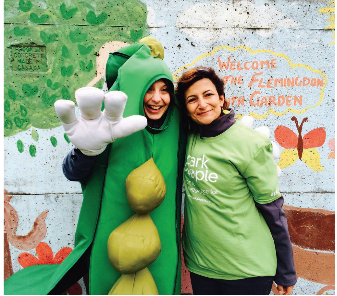
Flemingdon Park Community Garden

We also interviewed two dozen people working on the ground, including local residents, non-profit organization staff, and government staff to understand the opportunities and challenges they face in their work. We spoke to people in Toronto, Edmonton, Winnipeg, Los Angeles, New York, Austin, and Portland.