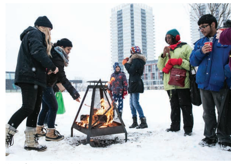
Winter fire pit at Regent Park

The exit or reduction of a partner's role often means a community park group has to recalibrate itself. Sometimes this restructuring means taking on fewer projects or events. Many community organizers spoke about the importance of "succession planning," which means working with volunteers to ensure that if and when a partner organization moves on, residents will